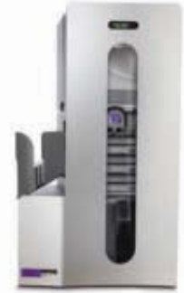
Producer III 8100